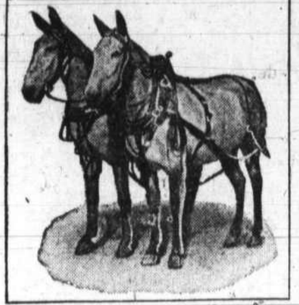
These Mules Sold for $600.

The use of large horses and machinery is a large factor in determining the profits of the farmer. The most profitable farms of to-day have more and better horses and are also